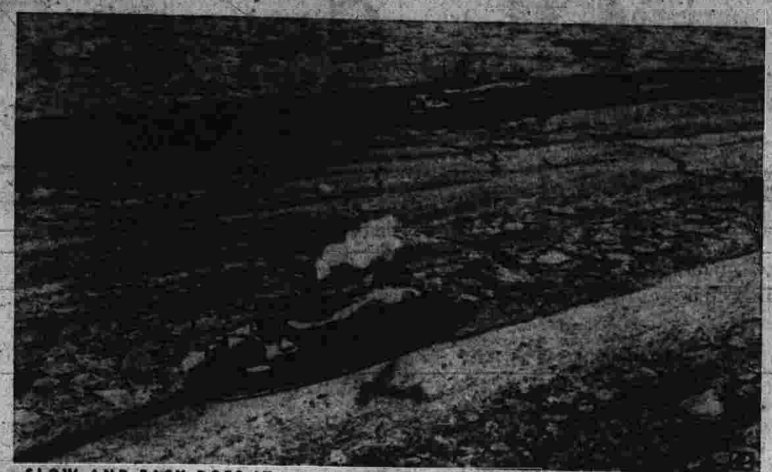
SLOW AND EASY DOES IT —Two ferryboats move carefully through the ice-patched Madam River near Newburgh, N. Y., after a frigid, Canadian air mass caused temperature to drop 25 degrees to nearly zero in less than ten hours.