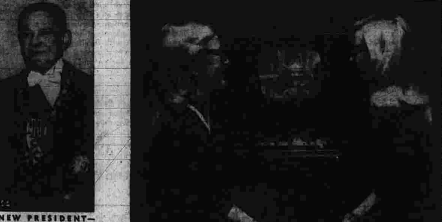
NEW PRESIDENT —French President Rene Coty wears the gold chain and sash of Grand Master of the Legion of Honor in inauguration at the Elysee Palace, Paris.