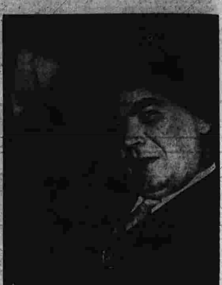
ENVOY'S GESTURE —Soviet Ambassador Georgi Karshin appears to wave as he leaves Washington talk with Secretary of State John Foster Dulles on atom bomb plans conference.