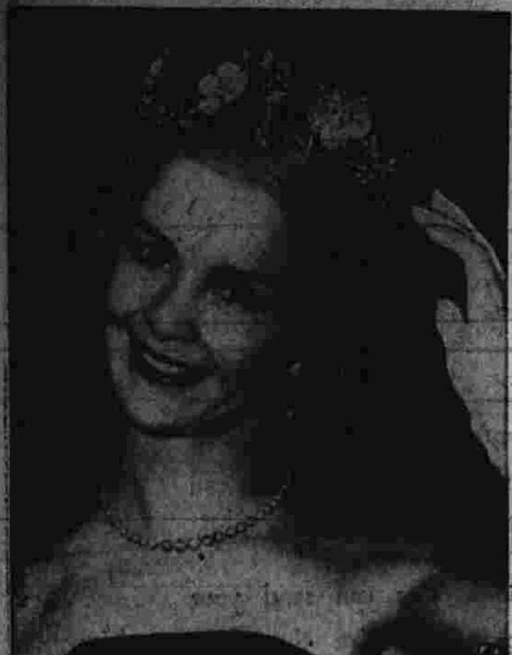
QUEEN OF DIAMONDS —Barbara Ann Scott, ice cream star, wears the $100,000 diamonds with which she was crowned Queen of Diamonds by diamond manufacturers New York. She was formerly owned by the Austrian Imperial family.